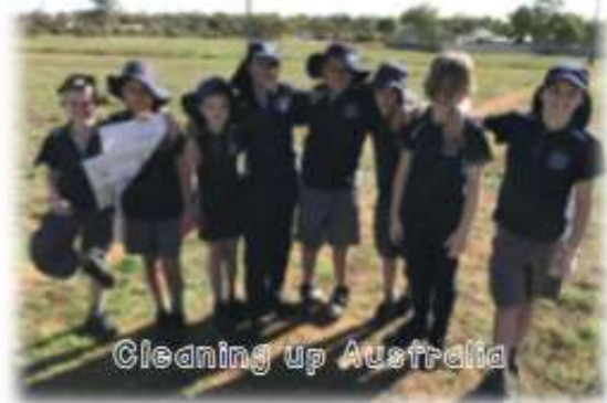
Cleaning up Australia