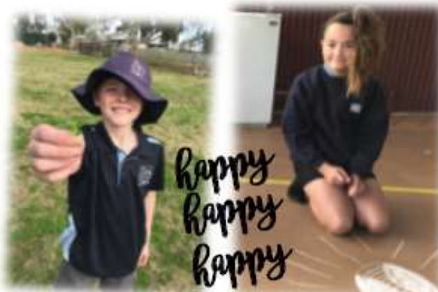
Happy Happy Happy