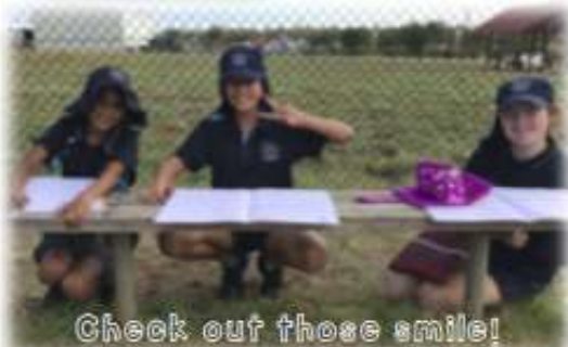
Check out those smile!